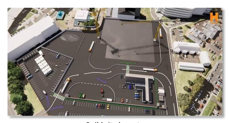
Build site layout