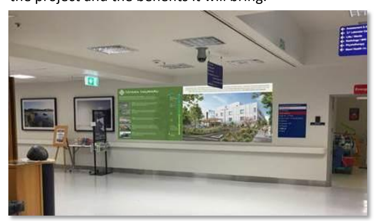
Proposed location inside North Shore Hospital

Wall graphics will shortly be placed inside the front entrance to North Shore Hospital and along the fence line on Taharoto Road to give the public details about the project and the benefits it will bring.