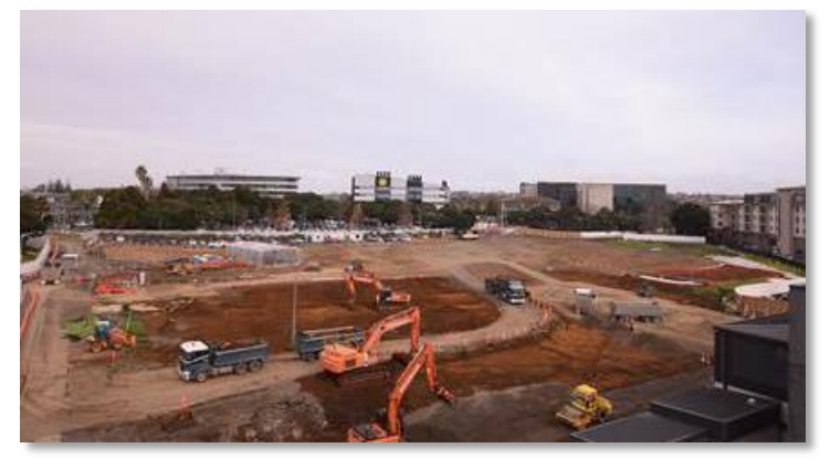
Earthworks have started on the build site

Work is continuing to progress on the build site. Redundant in-ground services have now been removed and earthworks and preliminary drilling works are now underway. The site is currently 97% asbestos-free, with this last section of affected material to be removed by the end of July. Phase one of the Hawkins site establishment plan has now been completed.